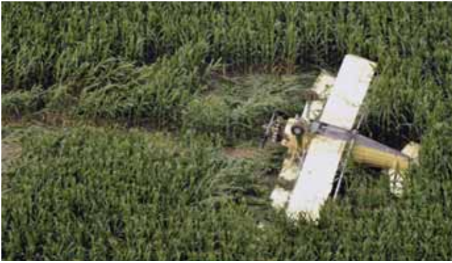
This crop duster came to grief after a forced landing in a cornfield. If possible, avoid fields with tall crops.