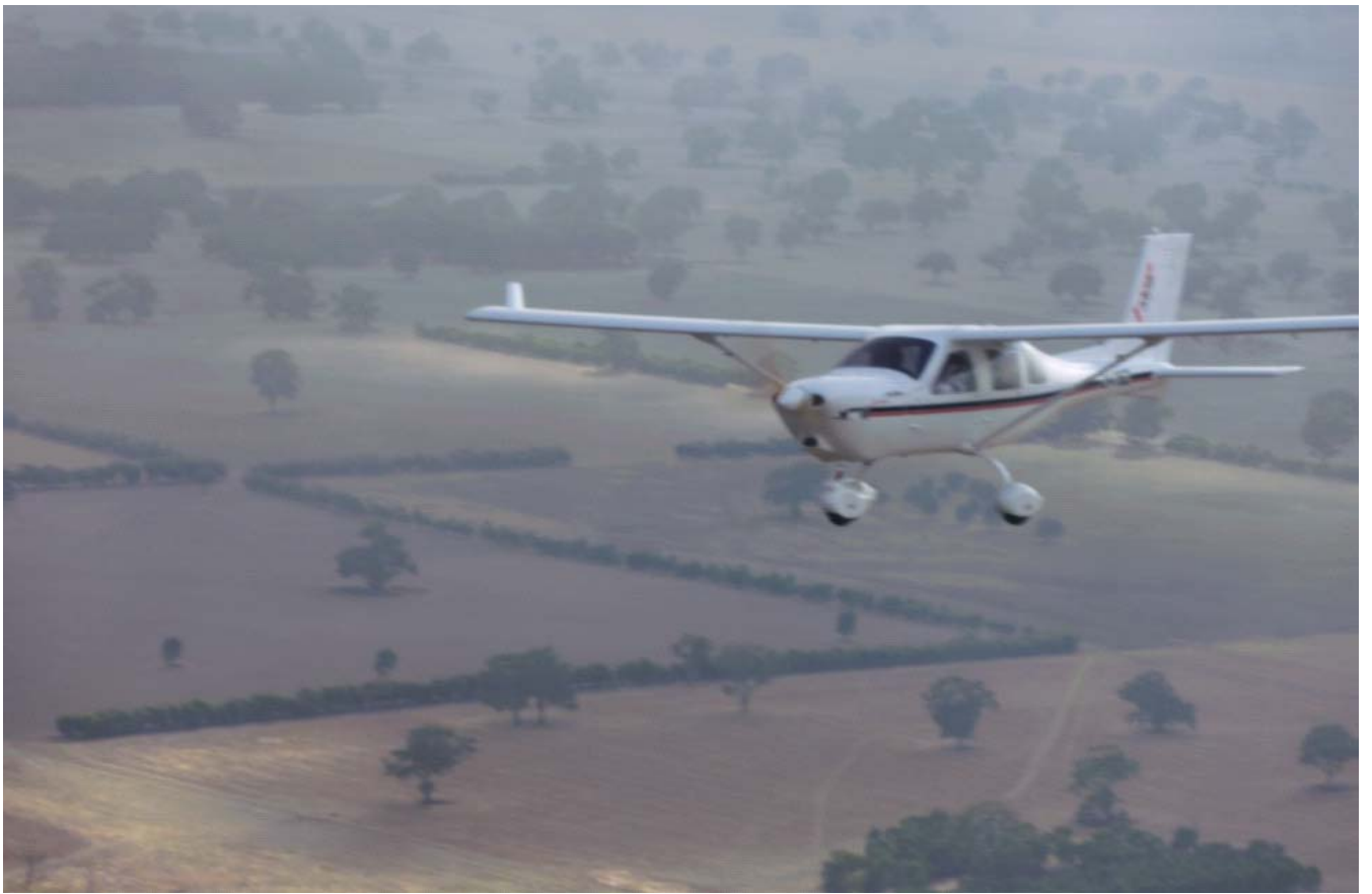
That's a J230... fast approaching and without a GPS to guide them