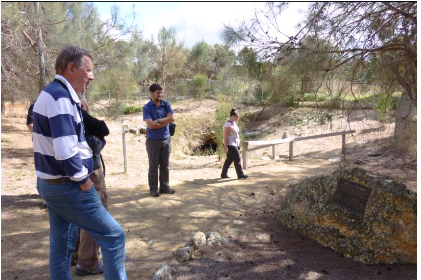
About to enter the caves