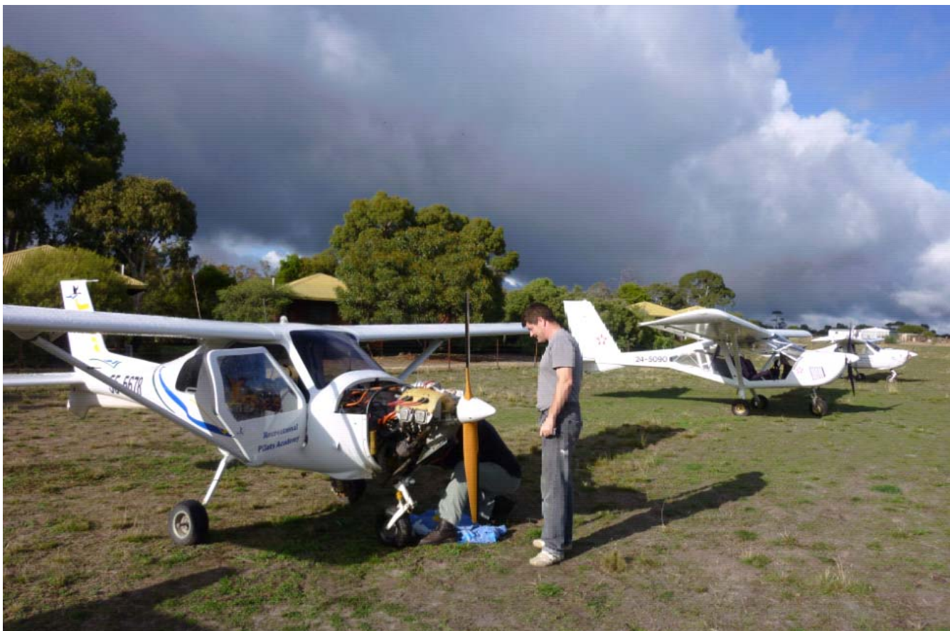
Is that 5678 again? And is that Marc under the engine bay? Boy it rained last night