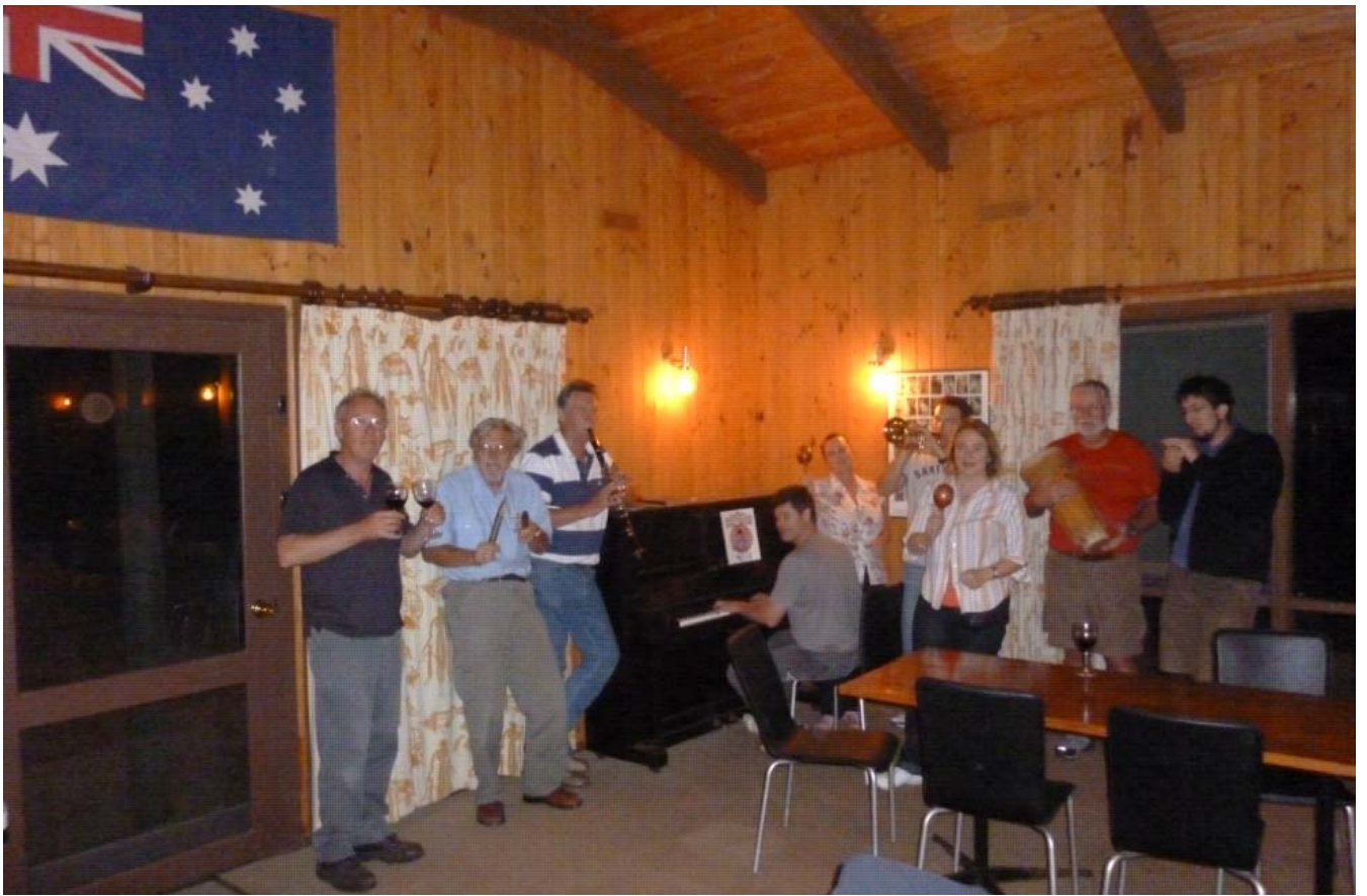
Very “loosely” called the RPA band