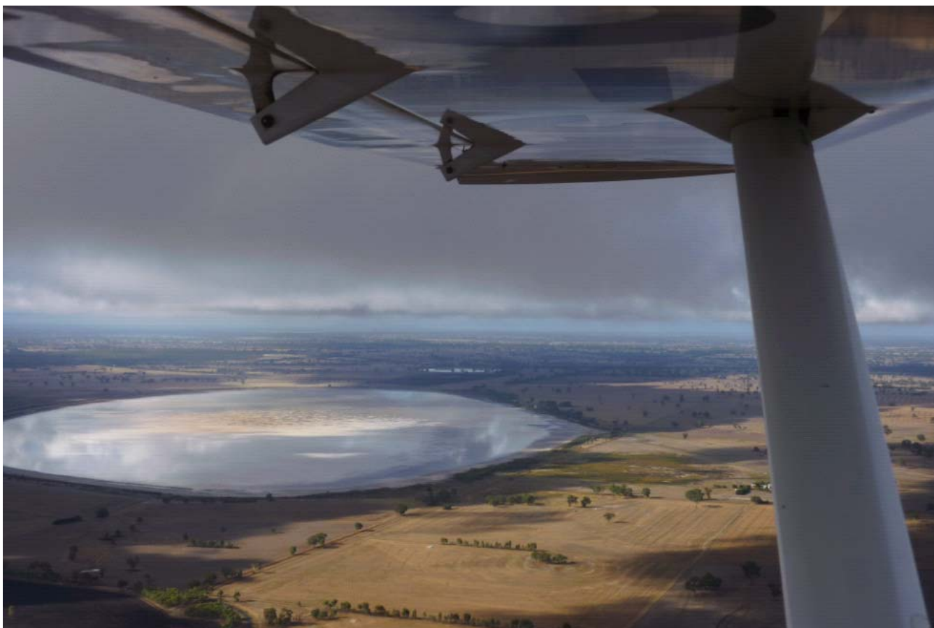
Off to Naracoorte with a 1500ft ceiling