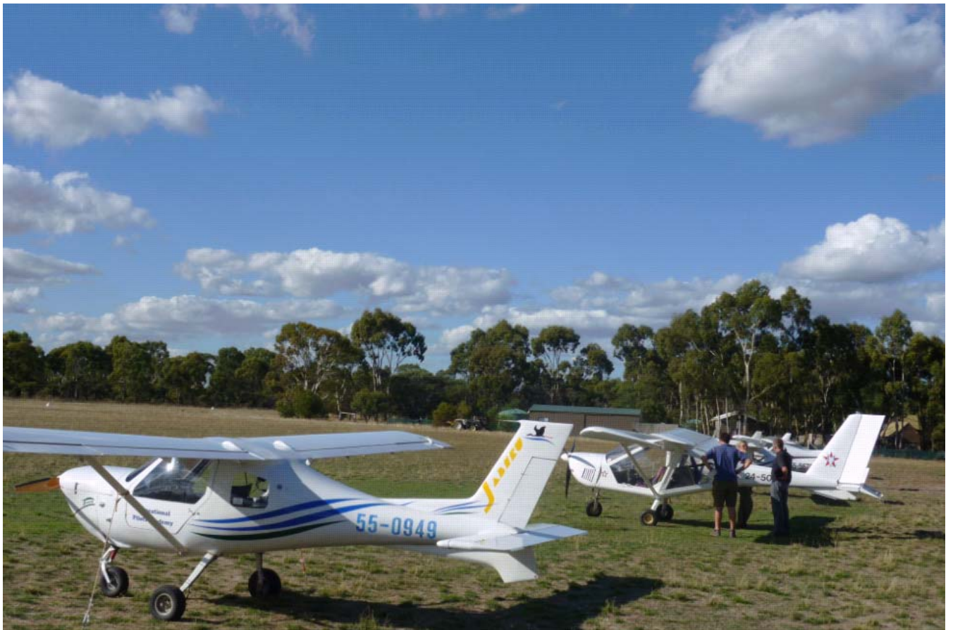
The afternoon back at Asses Ears, some tied down for the night