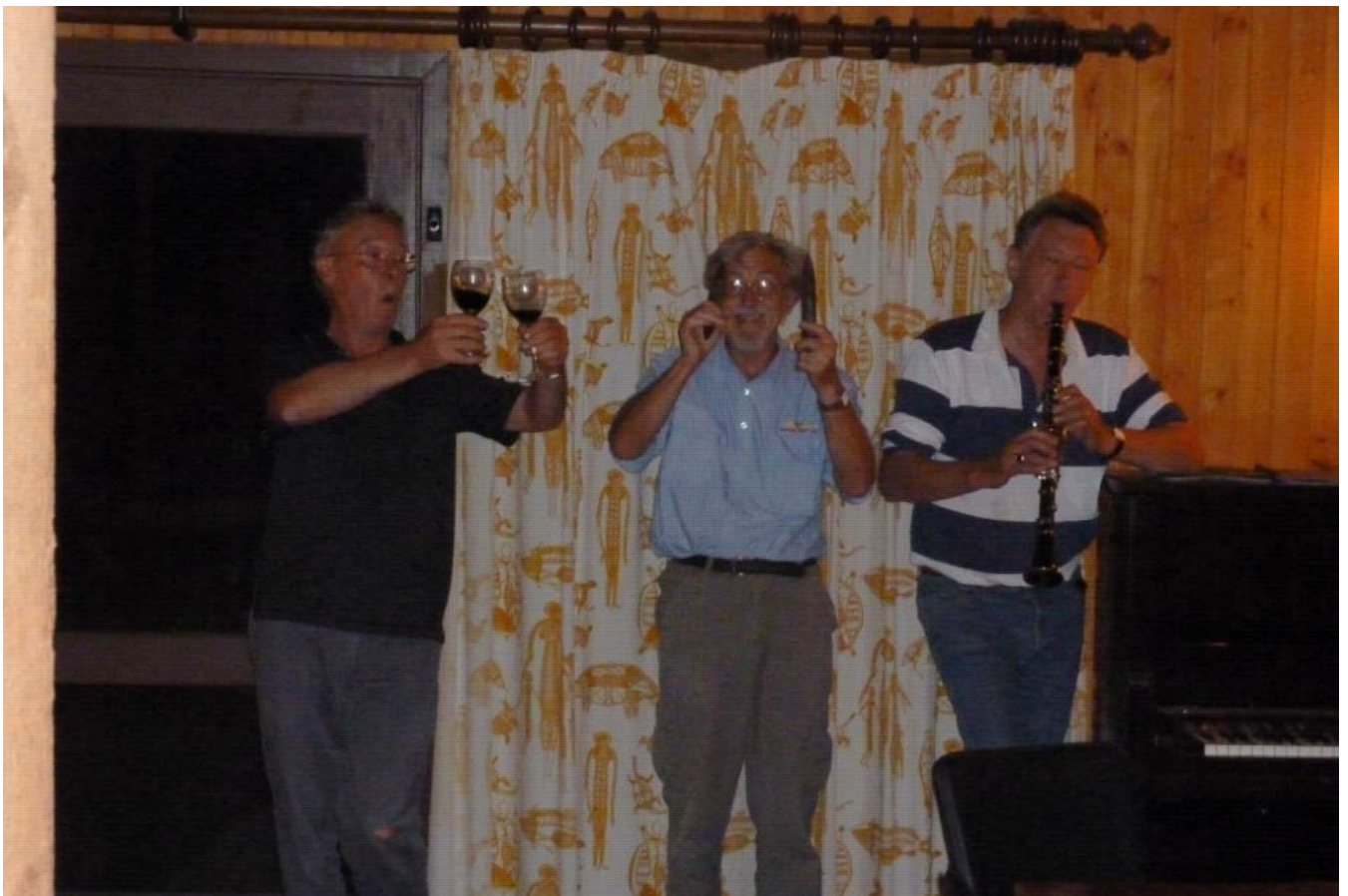
And for those who didn't have instruments... some improvisation was called for